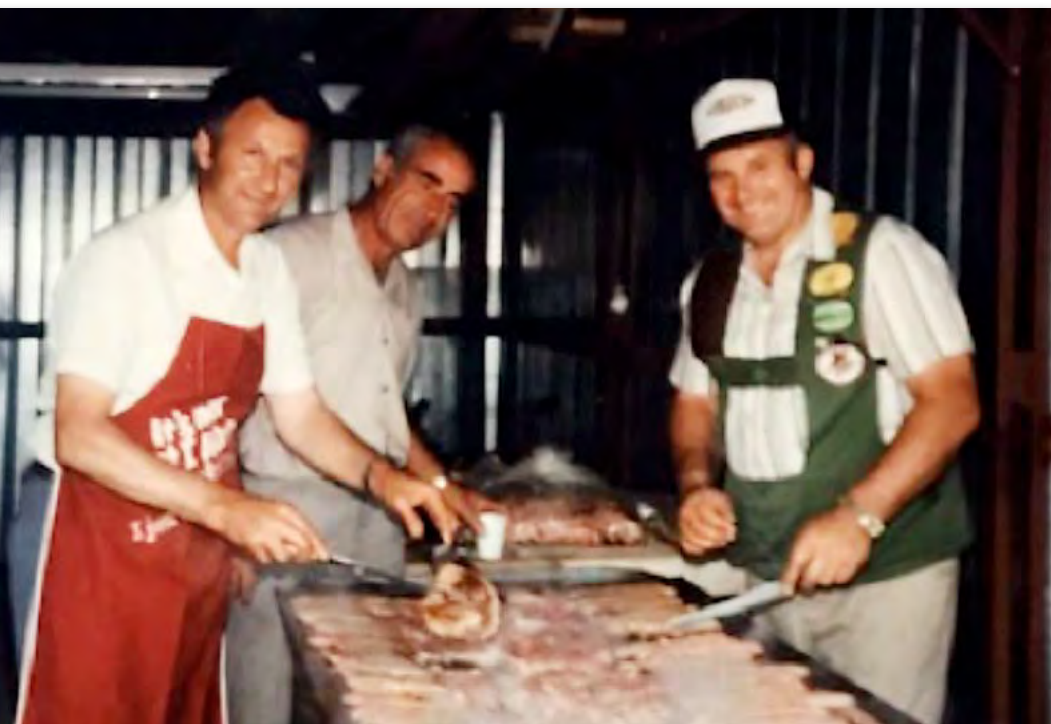
Old club, always lots of food and families