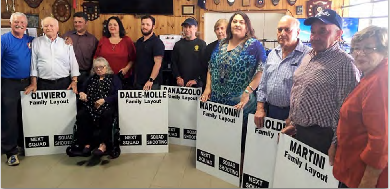
Foundation Members or their families receiving ground naming plaques