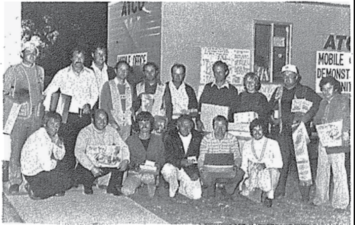
Happy trophy winners after South Aust. Trench C'ship (International Gun Club).