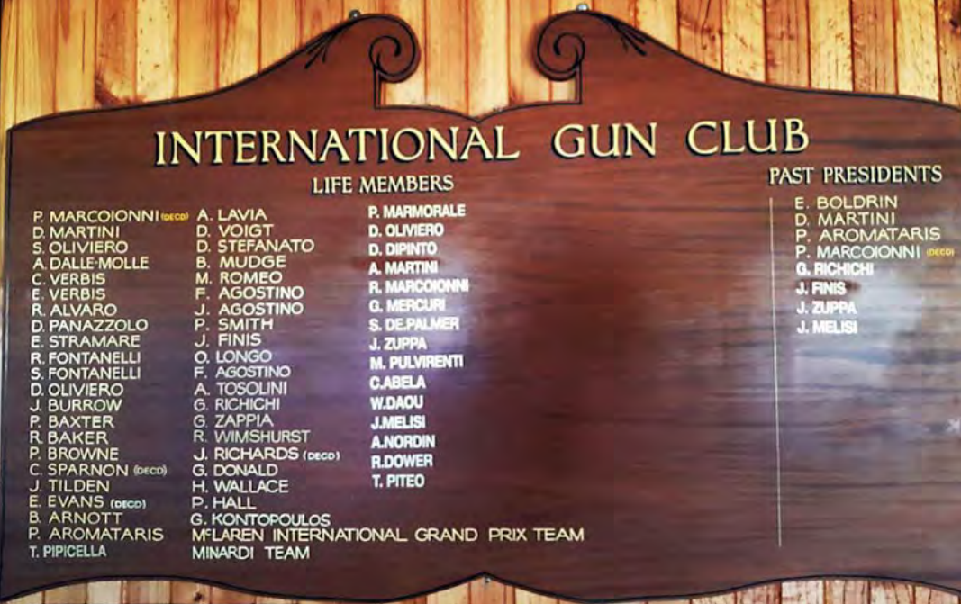
Life Members board showing McLaren and Minardi Formula One teams