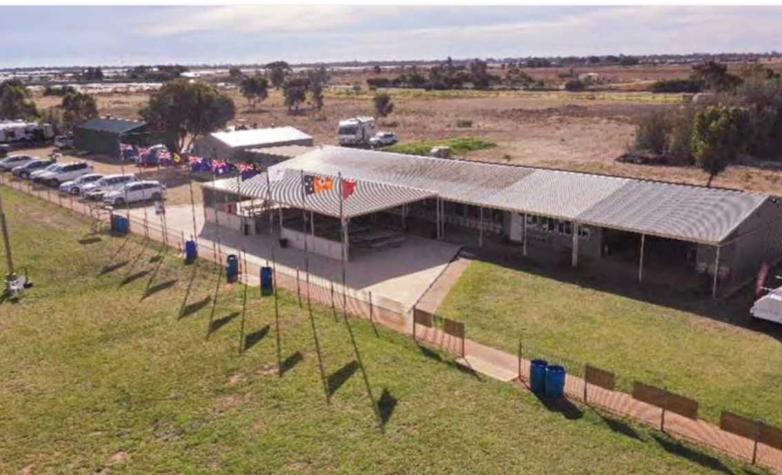
The International Gun Club today

The International Gun Club of today thanks all for their support, a special thank you to all the family members especially the ladies who ran our canteens,