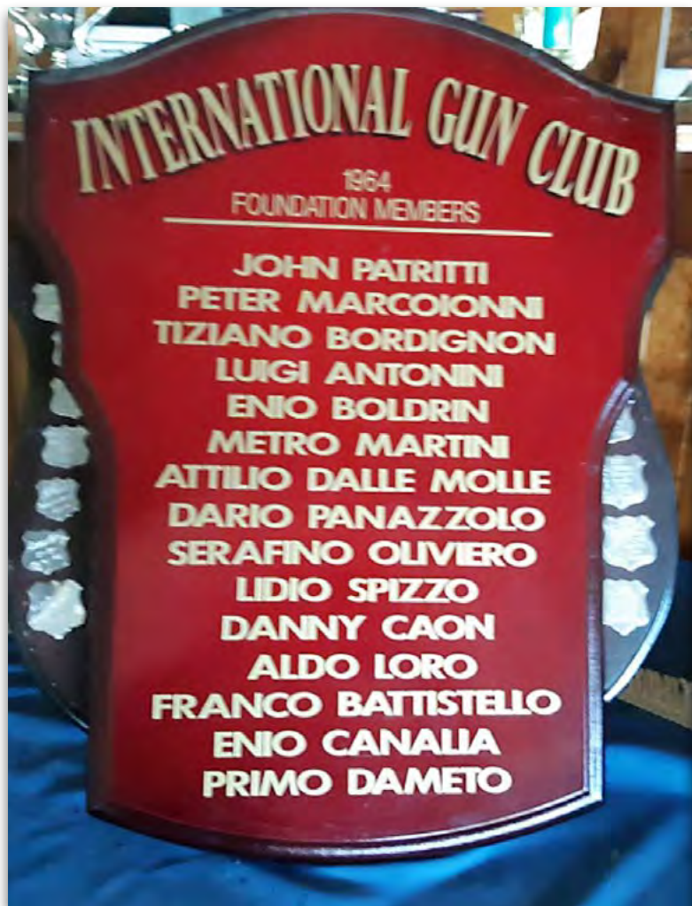
Founding members Club Plaque