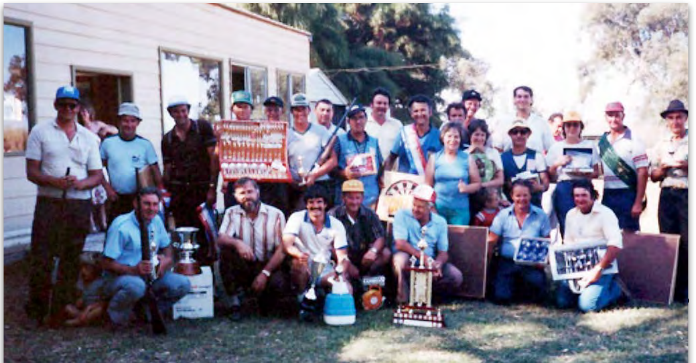
International first clubhouse building opening, birthday shoot with Franchi shotguns donated as prizes