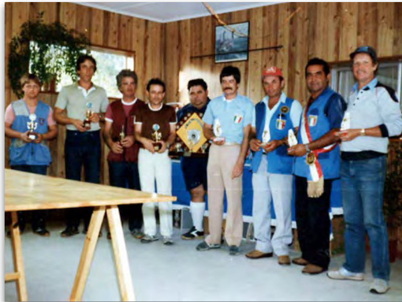
Presentations in the new clubhouse, first photo the Marconi Gun Club and International teams, of course Inter always won