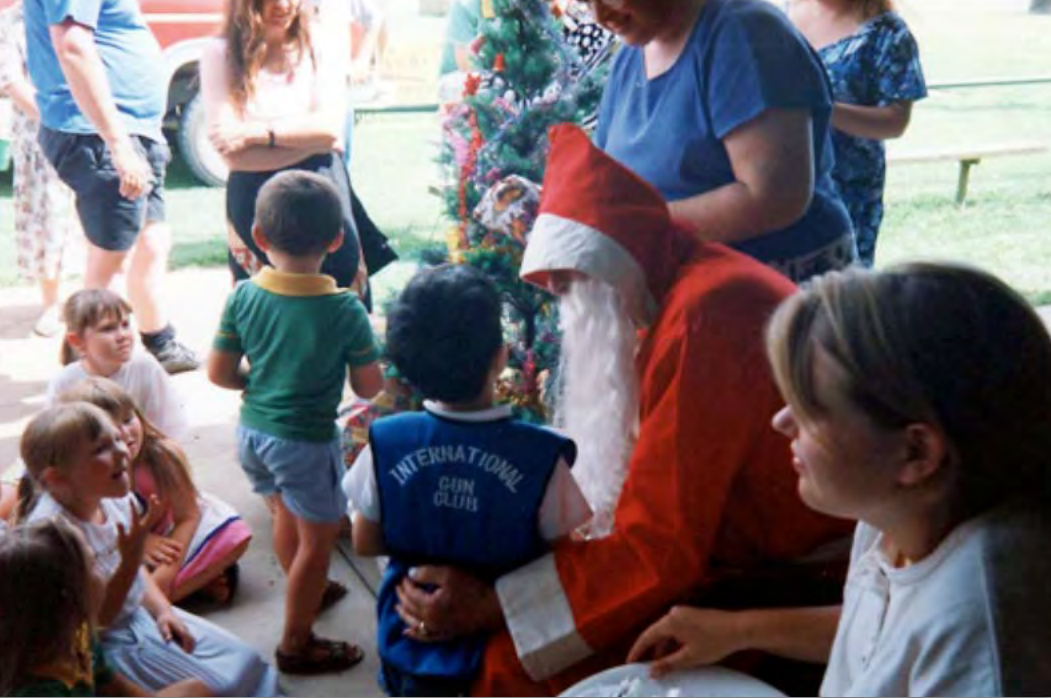
International, always lots of children